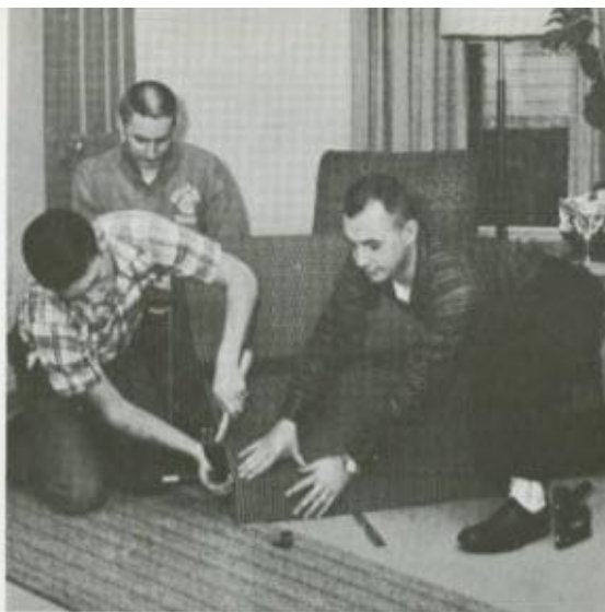
Everyone helped with this custom-built hi-fi!

Winning the SCA scholarship trophy for the second consecutive semester was one of the events that made Stellar Brothers' fifth year at Purdue very successful. Other accomplishments include winning the SCA track meet, winning the ping-pong doubles title for the third straight year, and placing second in basketball. The installation of their custom made stereo sound system in the dining and recreation room areas provided members with many hours of enjoyment. Candles supplied all the light at the Stellar Brothers' Christmas Candlelight Dance which was the highlight of the year. Other Stellar Brother functions included a Christmas party for underprivileged children, open houses after home football games, and various trade parties.