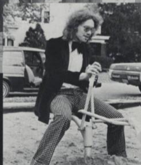
APO Blood Drive donators Pulled in man tractor pull Active in intramural sports