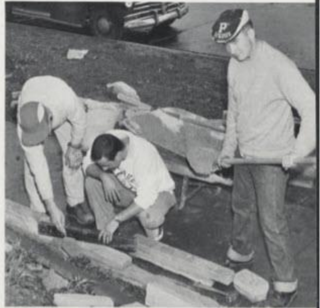
These industrious workers from Stellar Brothers find that the project of building a good retaining wall is a man's job.

With remodeling as the word for the day, we began an extensive "face lifting" program which effected a new porch, new siding and steps, sidewalks and a new sandstone wall. The Old Soldiers Home was the site of our first trade party, a wiener roast with Glenwood, and a dance party at the Co-Rec Gym with Northwest X was subsequent. A decorating party, at which time half of the house went to Twin Pines and half of the Twin Pines house came to decorate with us, ushered in the Christmas season. The spring ice cream social held for all the co-ops concluded another year at Stellar Brothers.