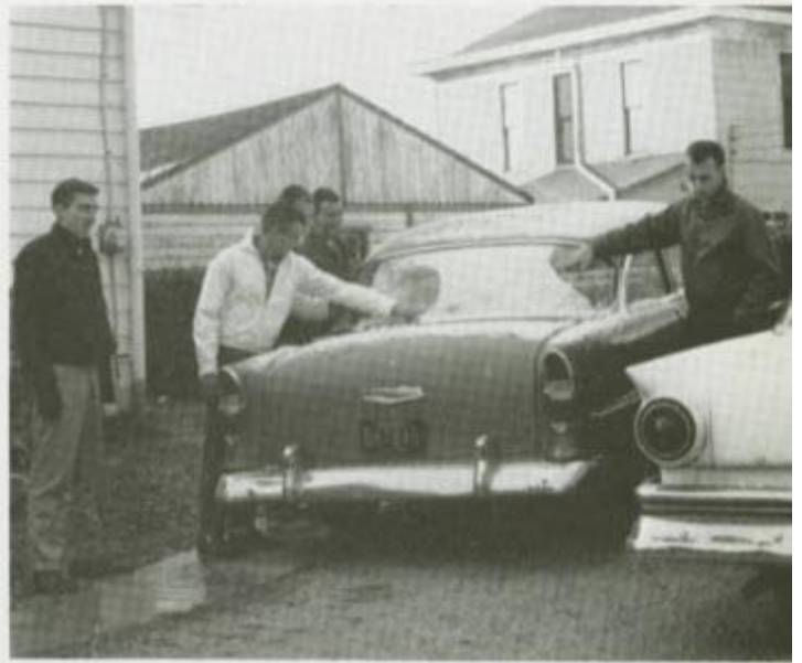
Well, it's about that time, guys!

The 1962-1963 academic year for Stellar Brothers Co-op was started off by their winning of the co-op track meet for the second consecutive year. As in previous years, Stellar Brothers held their annual S.C.A. ice cream social for all the co-ops on campus. This proved to be a big success. A highlight of the Yuletide season was the annual Christmas party for under-privileged children. Each member of the house adopted one of the children for the party and participated with them in Christmas games. "Your Option" was the theme of a costume party Stellar Brothers had with Shoemaker, and everyone dressed up according to their major. Ending the year with the spring formal house dance, they decorated the house with a scenic moon and glittering stars silhouetted in the moonlight to follow the theme, "Moonlight Majesty."