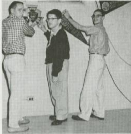
Finding a location for the plaque is the only problem that remains before the freshmen complete their project for the year.

Making popcorn balls, exchanging presents, and showing cartoon movies filled the members and the underprivileged children with Christmas spirit. The social activities began early with trade parties and dinners with Glenwood, Shoemaker and Twin Pines. Although Stellar Brothers is only three years old, they gained permanent possession of the SCA spring basketball trophy by winning the championship for the second year in a row. The annual ice cream social helped to promote new friends among the co-op students. The girls baked the cakes and everyone enjoyed free food and square dancing. The social also gave them a chance to use their newly completed front porch.